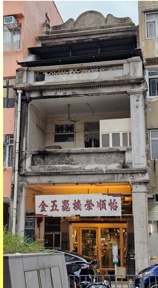
正立面 Front elevation