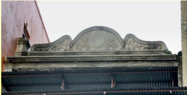
屋頂矮牆 Roof parapet